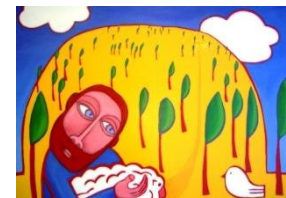
‘The Parable of the Good Shepherd’